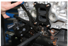
Hose Clip Pliers - for Single/Double Ear Clips | 8261